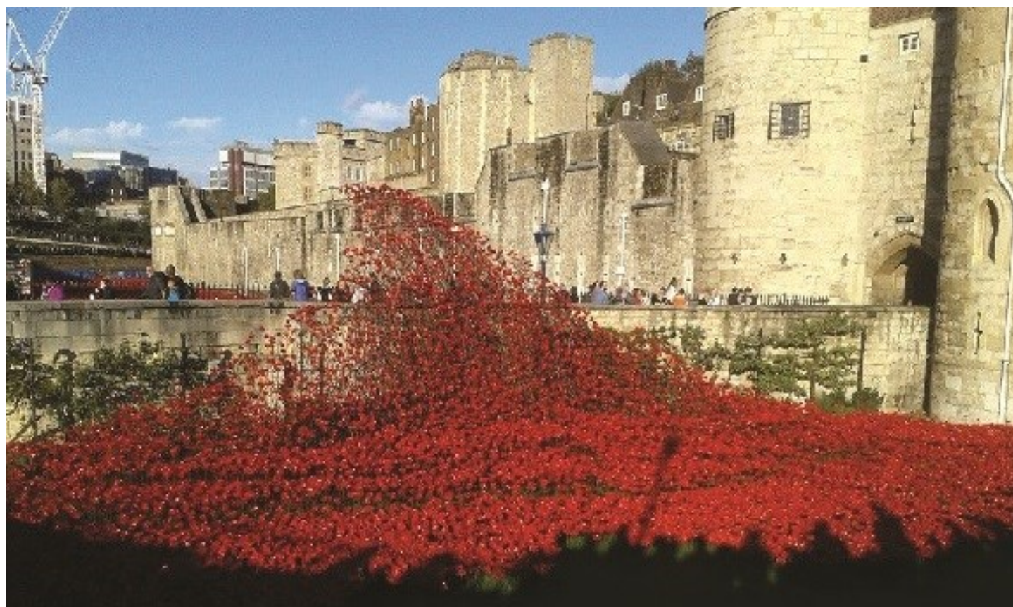
Poppy display at the Tower of London 4.10.14

Wednesday 26th November - KVH - 7.30pm Christmas Flower Demonstration Evening